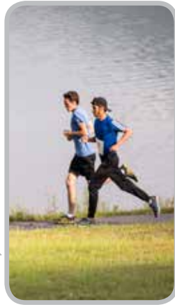
Runners participated in the annual 1 mile Fun Run and 5k race that circles around beautiful Lake Junaluska.