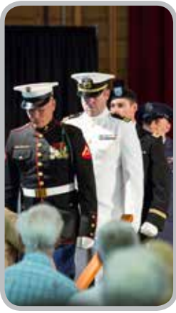
Military officers were honored for their service Monday evening during the Memorial Day celebration.